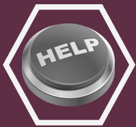
Debt Issuance Support and Coordination

The firm provides a wide array of services to meet our client's needs, including, debt planning and issuance, tax base analysis, developer mitigation, financial and facilities planning, and more. Capitol PFG prides itself on providing innovative, cost effective and ethical solutions to all clients.